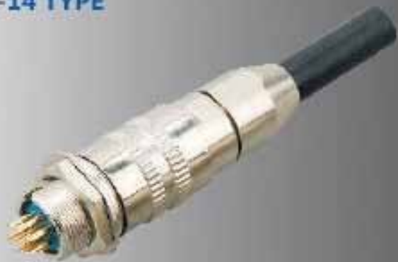
YS2-14型(卡扣式) 2T-7T YS2-14 TYPE